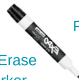
Dry Erase Marker