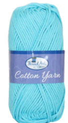
String or Yarn