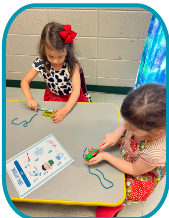
Above: Students “brushing teeth”