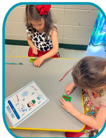
Above: Students “flossing teeth”